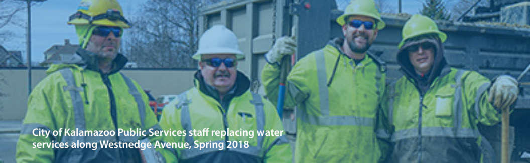
City of Kalamazoo Public Services staff replacing water services along Westnedge Avenue, Spring 2018