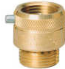
Hose Bib Vacuum Breaker

You can install hose bib (faucet) vacuum breakers to prevent backsiphonage through hoses. The drain line from your water softener can be shortened or suspended so that there is an air gap between it and sewer pipe. In other instances, you may need professional assistance in determining the appropriate protection against backflow.